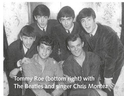
Tommy Roe (bottom right) with The Beatles and singer Chris Montez

"The stage was a boxing ring and bounced around like a boxing ring does," Roe said of the concert, which attracted more than 8,000 screaming fans. "They didn't need an opening act, but I was glad to do it. I used to joke with John and Paul [on the road] that Chris and I were the