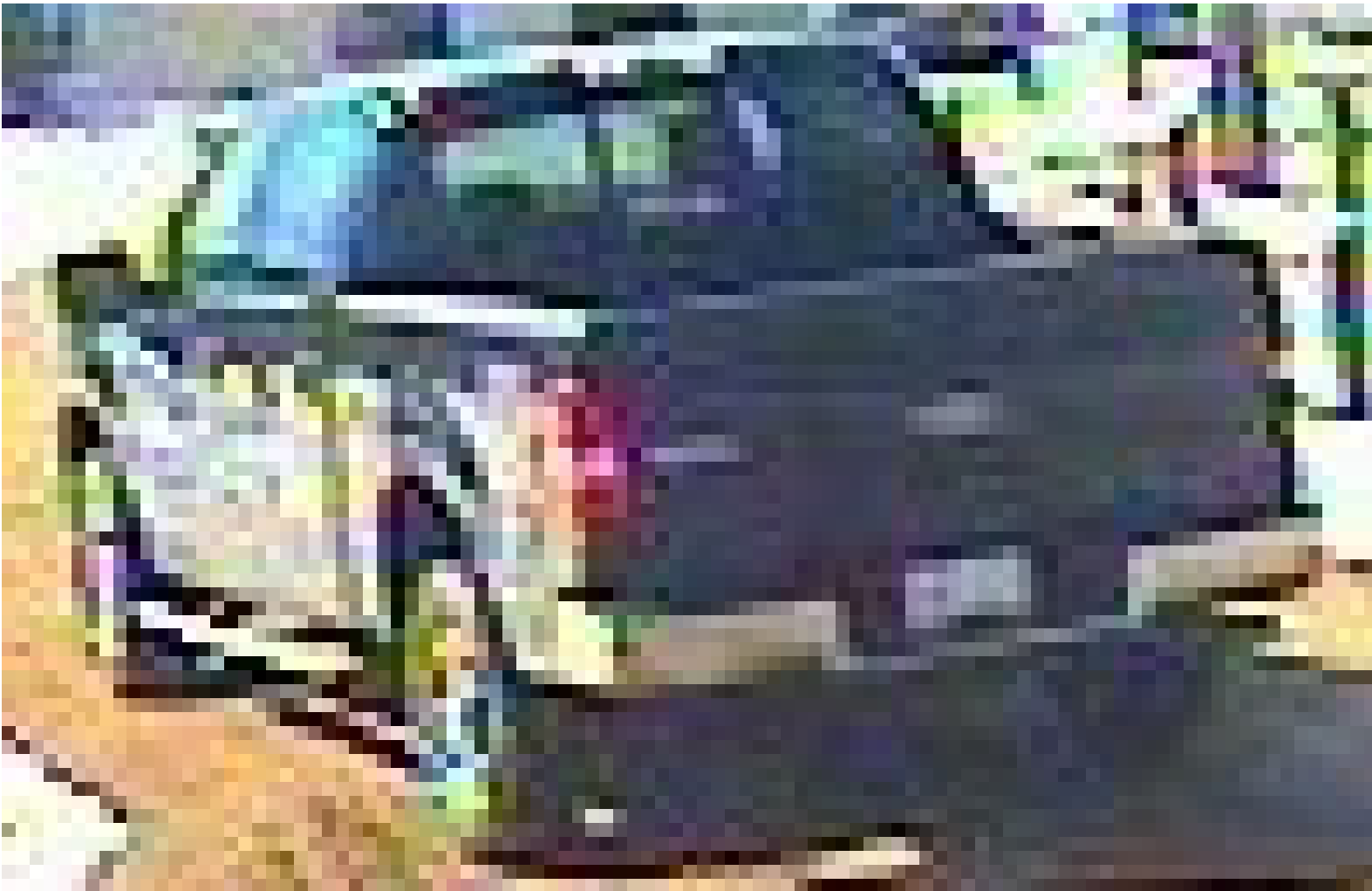
Costco Plate Zoom In