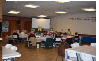
Spirit of the Glen