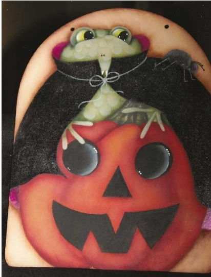
4 hours - Viki Sherman “A Wee Bit Wicked” Level: Beginner/Intermediate/Advanced Medium: Acrylic Size/Surface: 9” X 11” wood (MDF) Supplies: Good Liner Cost: $12.00