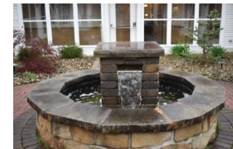
Fountain/Courtyard in Scott Lodge