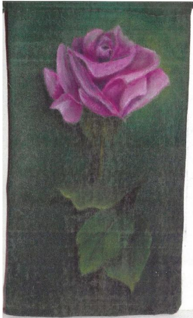
4 hours – Rosemary Habers “Single Rose”