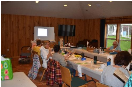
Classes in the Conference Room in Scott Lodge

Level: Beginner, Intermediate, Advanced Medium: Color Pencil Size/Surface: 8” X 10” Suede Board Supplies: Pencil Sharpener, Kneaded Eraser. Cost $18.00