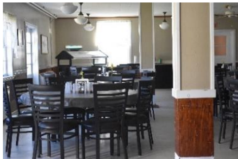
Meals at Scott Lodge