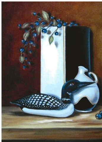
6 hours - Carol Hoffman "Blue Berries & Loon"