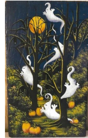
6 hours - Laura Angelo “Haunted Slate” Level: Beginner/Intermediate/Advanced Medium: Acrylic Size/Surface: 12” X 20” Slate Supplies: Sea Sponge, Regular Painting Supplies Cost: $20.00