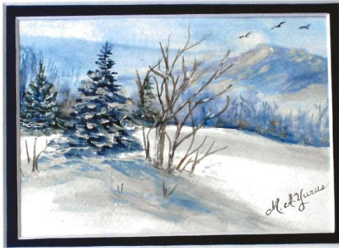
4 hours - MaryAnn Yurus “First Snow”