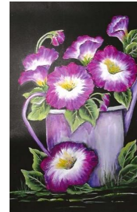
6 hours - MaryAnn Yurus “Watering Can” Level: Intermediate/Advanced Medium: Acrylic Size/Surface: 14” X 15” Fabric Banner Supplies: Firm Bristle Brush, regular painting supplies Cost: $20.00. Includes rod, ends and cord.