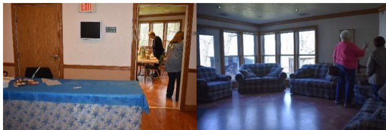
Registration outside the Harold Room