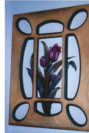
4 hours - Lynn Banting "Reversed Glass Tulip"