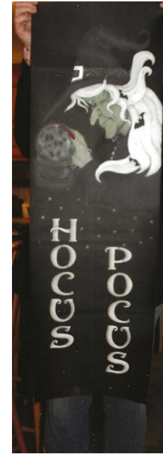
6 hours - Viki Sherman "The Witch Maeve"

Level: Intermediate, Advanced Medium: Acrylic Size/Surface: 14" X 42" Blackboard Fabric Supplies: Stencil brushes, Good liner. Will need dowel rods for banner. Cost: $20.00