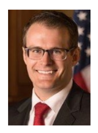
Lt. Governor Adam Greg

Governor's Office 1007 East Grand Avenue, Des Moines, Iowa 50319