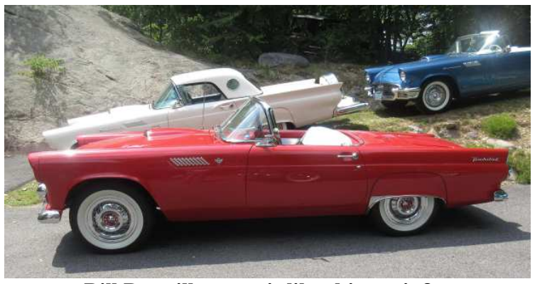
Bill D - will we see it like this again?