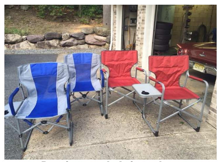
Day after - somebody forgot these