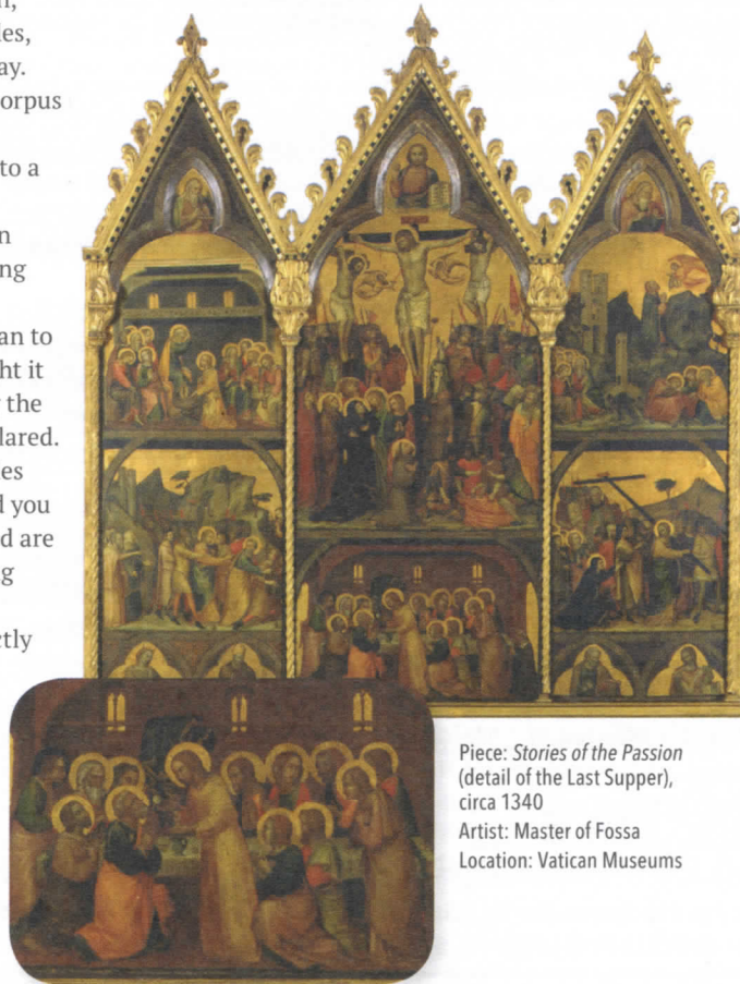
Piece: Stories of the Passion (detail of the Last Supper), circa 1340

Should I look for ways to make my faith in his presence grow, perhaps by going to adoration this week?