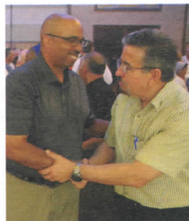
CATHOLIC CONVOCATION, ORLANDO