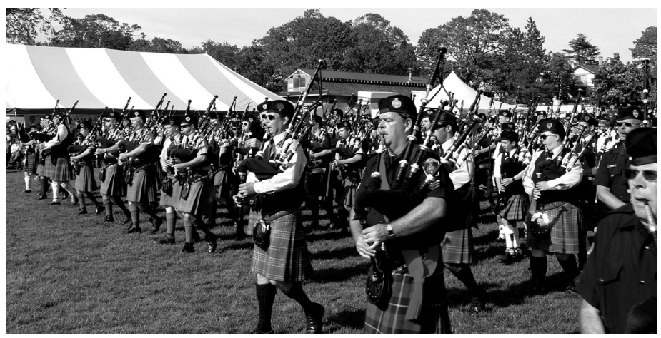
Can you hear the echoing sound of the massed band as they march past?