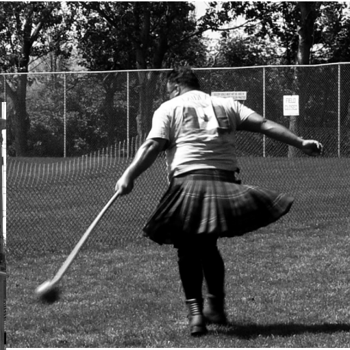
The heavy events were watched through a heavy wire fence, a nuisance for picture taking but a comforting safety feature for the spectators.