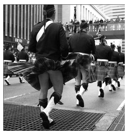
Any more questions?

The fine for car drivers is £60 and three penalty points on the license. The maximum fine for a bus, truck or van driver is now £2,500. \Delta