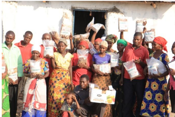
a feeding program in Bujumbura, Burundi