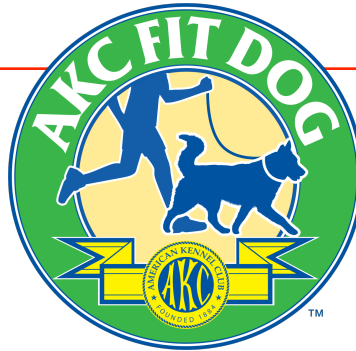
Tuesday night classes with Matt McMillan!

AKC's New FIT Dog Titles: The American Kennel Club is committed to improving and maintaining the fitness and health of all dogs and their owners. AKC FIT DOG titles were designed to provide a structured, individualized fitness plan that you and your dog can do together. There are 3 levels of AKC fitness titles—Bronze, Silver, and Gold. Each title requires a specific number of activity points to be completed, which varies based on title level. Find more information here: https://s3.amazonaws.com/cdn-origin-etr.akc.org/wp-content/uploads/2022/12/28131350/p-FINAL-FIT-Guide-JANUARY-2023.pdf