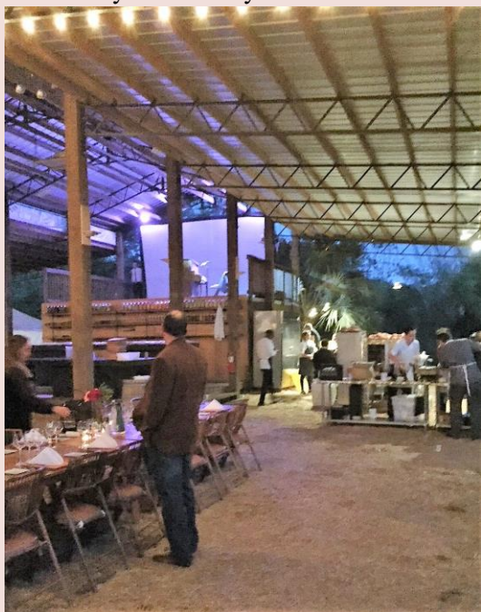
A peek into the kitchen area before the event