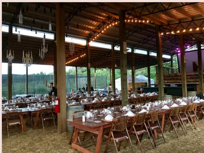
Swank staff setting up