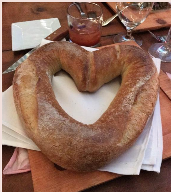
Our heart-shaped baguette bread