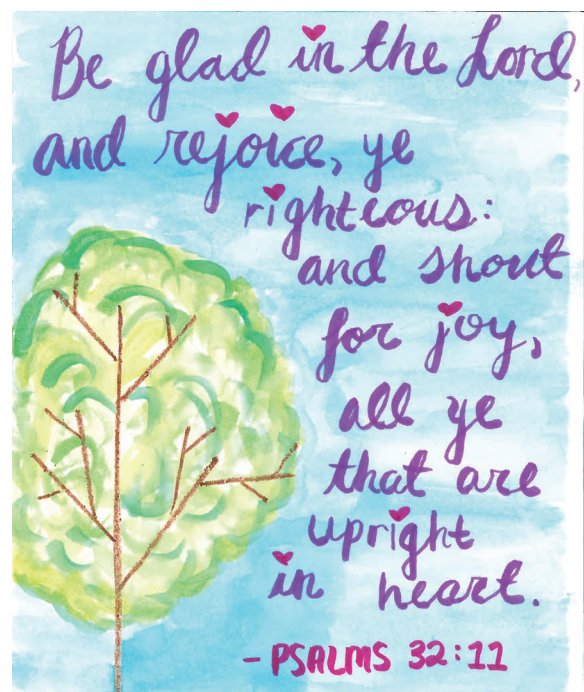
Artwork from Sunday School Students in New Orleans and Mobile (see attached letter)