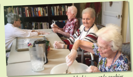
Residents enjoy preparing and baking maple cookies.