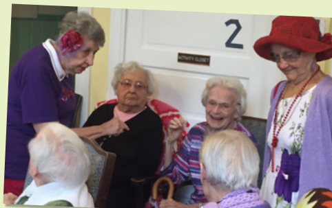
The Foxy Ladies (Red Hatters) from Oxford talked and sang with the residents and also brought them gift bags.