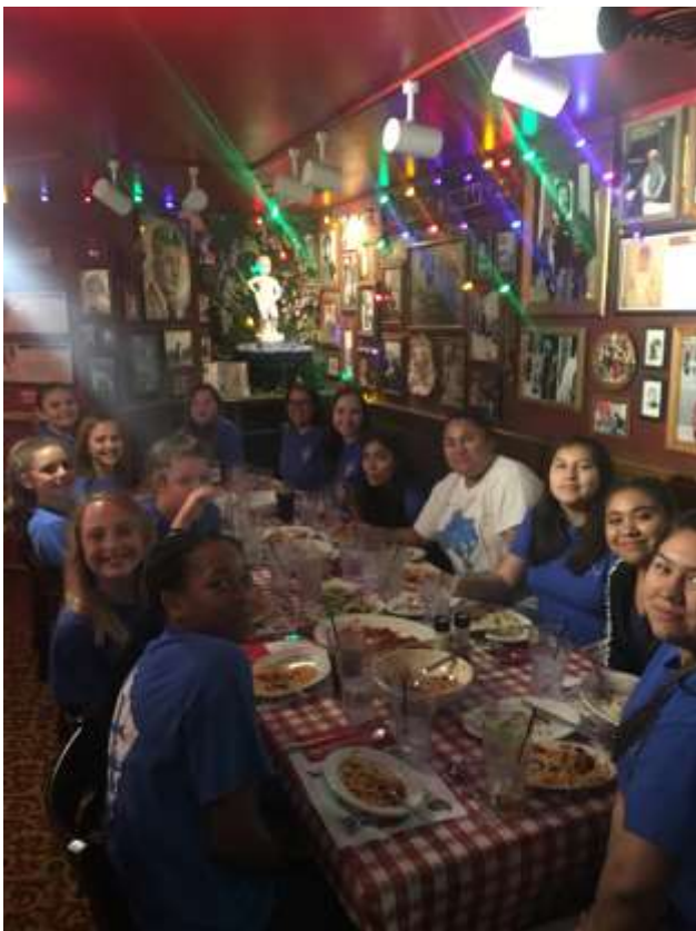
FUN DAY LUNCHTIME @ Buca Di Beppos