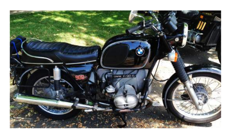
Nils Olson's 1976 BMW R60/6