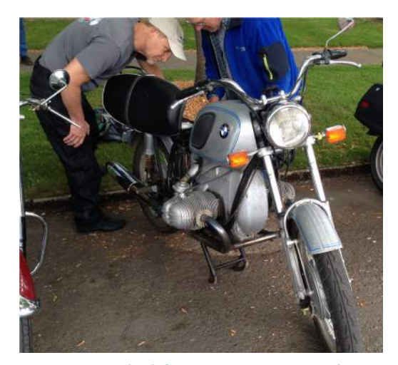
Bruce Reichelt's 1972 BMW R60/5