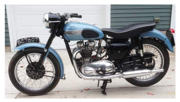
For Sale: 1956 Triumph Tiger 100 500cc