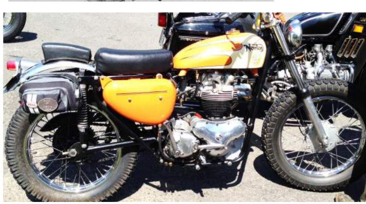
Theo Battaglia's Scrambler (mixed breed): 1959 Norton Dominator 37 ci engine, Matchless G1L frame, Triumph rear wheel, AJS gas tank, N15 Norton Oil Tank, Bater front end, with a headlight from a 1937 Dodge car.