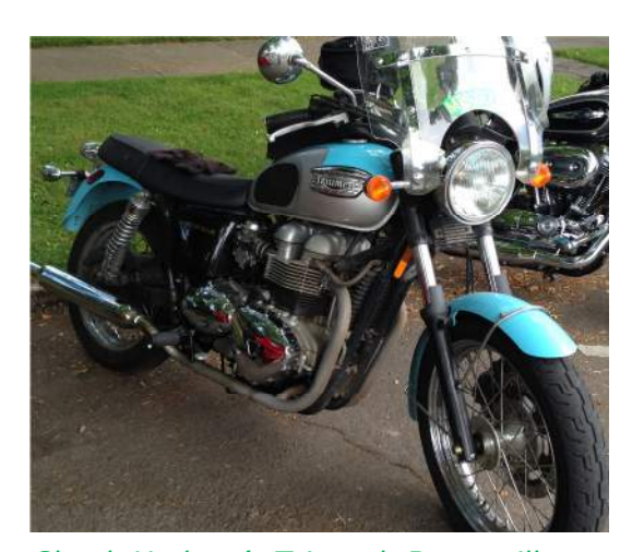
Chuck Hodson's Triumph Bonneville