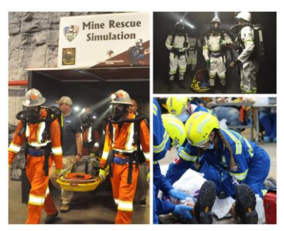
Mine rescue teams participate in the International Mine Rescue Competition in September 2022.

Today, over 250 mine rescue teams are currently certified and equipped to perform mine rescue operations in the United States. They train and compete in mine rescue contests nationwide, culminating in national championships for coal and for metal and nonmetal mines, so they are ready to answer the call that they hope never comes. When they are called, these rescuers do not hesitate. They undertake some of the most difficult and risky emergency response work in this country, sometimes traveling miles in dark underground mines filled with debris and poisonous and explosive gases to find missing miners or recover those who did not survive.