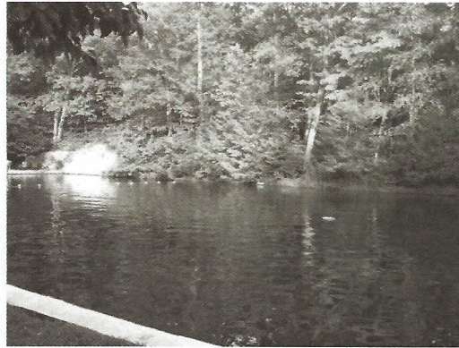
Highlands Natural Pool, 2008

I was shocked to find out last year that the current owners of the property had shut everything down, and were planning to demolish the buildings. It was so disappointing to find that a so-called ‘conservation’ organization would be willing to destroy something so beautiful, which was the lifetime work of so many people. But the problem was money. NJ Audubon could not afford to continue running the Camp, and decided to give it to the State of New Jersey. The State was happy to take free land, to add it to Norvin Green State Forest which borders Camp Midvale. But they had no money to maintain buildings and demanded that the buildings be removed before they would accept the land. The more I got involved, the more I realized that my state is doing a terrible job with the historic buildings already under its control. Many old and historically important buildings, even those dating back to the Revolutionary War, are abandoned and in decrepit shape. The ones that were being cared for was mostly due to the efforts of volunteer groups, private organizations, and local governments. So I could see right away that Camp Midvale would have no chance in their hands.