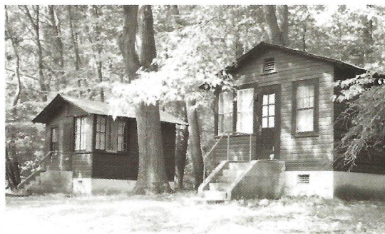
Cabins on the grounds (photo taken in 2012)

Camp Midvale was the center of all social life and recreation for the neighborhood. When I was a child, most of the neighborhood surrounding the camp was German speaking. During our school vacations, we went to the pool every single day, and didn't go home until it was time for supper. As the years went by, the children who grew up there formed close friendships. For a child, it was paradise.