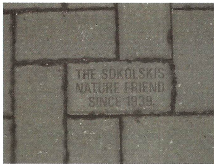
Memorial stone at the Highlands Pool

This is about my personal experiences working on the project to save the oldest surviving American Nature Friends Camp on the East Coast, Camp Midvale in Ringwood, New Jersey.