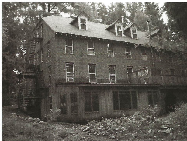
Former dormitory building Camp Midvale, then Weis Center

Now I am going to skip to the present day. I still have ties of friendship with many people that I grew up with in Camp Midvale. Even if we see each other rarely, because of our shared backgrounds we can speak to each other in a kind of shorthand. We know each other inside out. But since my parents sold their home near Camp Midvale in 2002, I would only visit once or twice a year, for our annual reunion at the pool, or perhaps to take a hike.