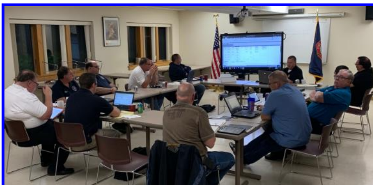
Wisconsin Divisions 101, 102, 103 and Illinois Division 4 annual Box Cards Review.

MABAS Wisconsin Divisions 101 (Kenosha), 102 (Racine), 103 (Walworth) and MABAS Illinois Division 4 (Lake) meet once a year to discuss topics in the area.