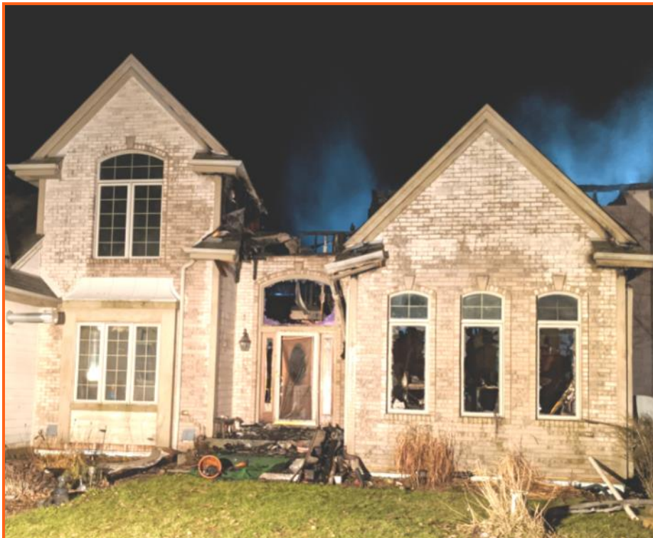
The house had some brick veneer, but otherwise was of lightweight wood frame that provided for quick fire-spread and destruction.