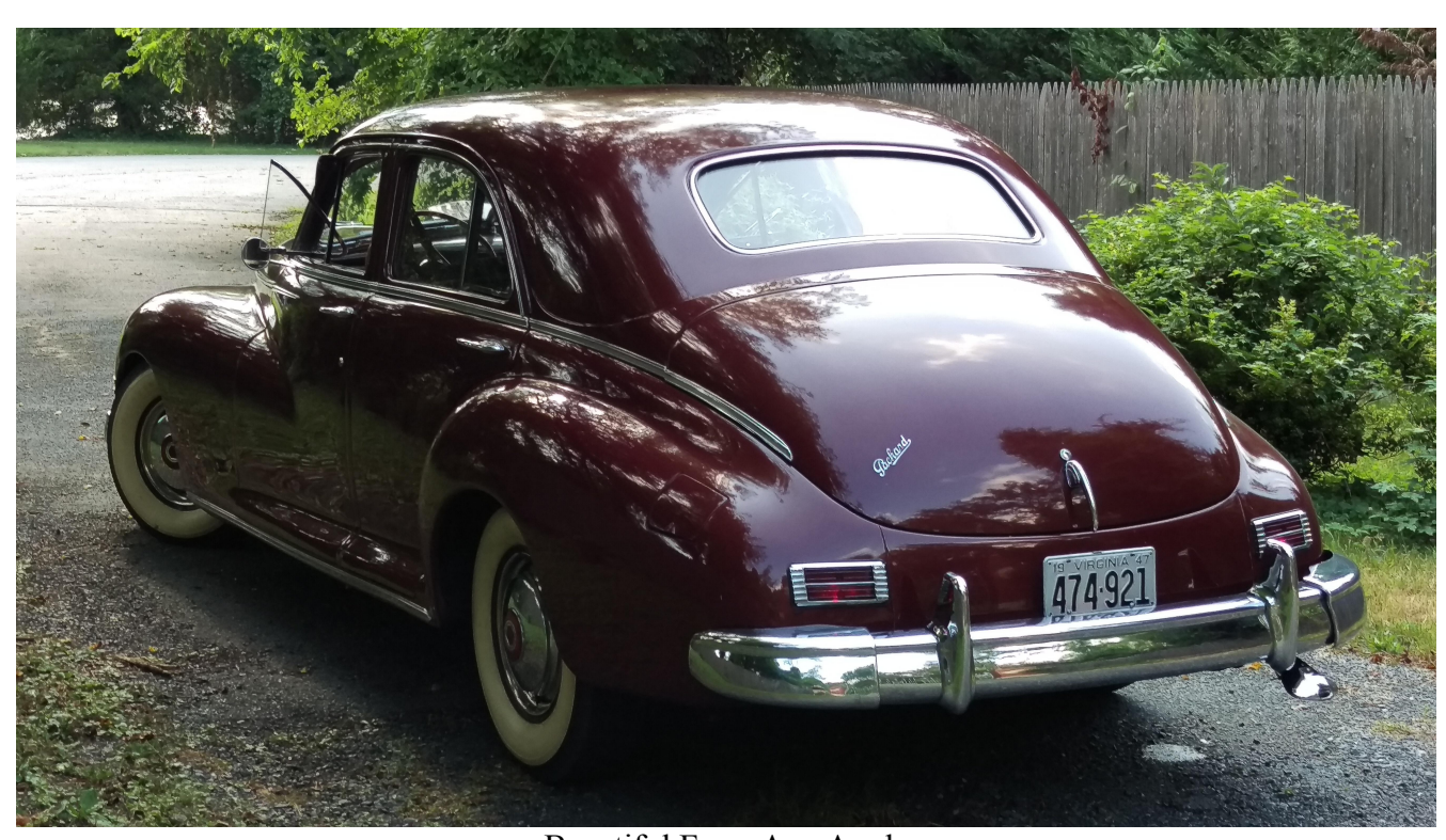
Beautiful From Any Angle