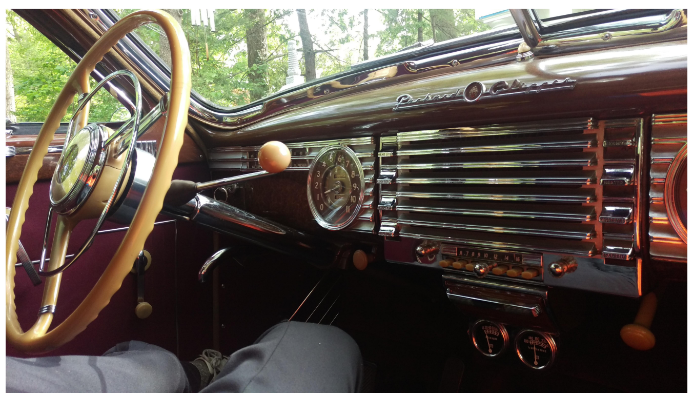
That Beautiful Art Deco Dash