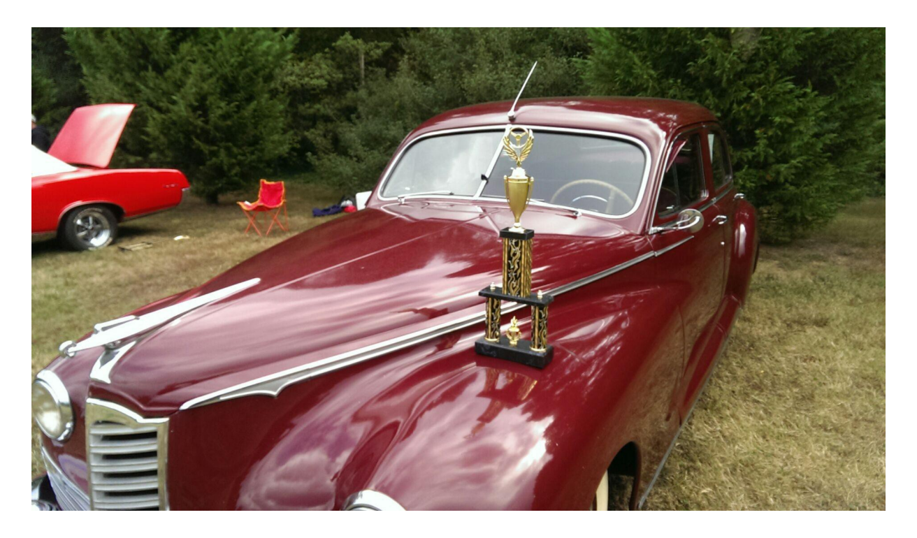
First Award!--American Horticultural Society Show Peoples choice