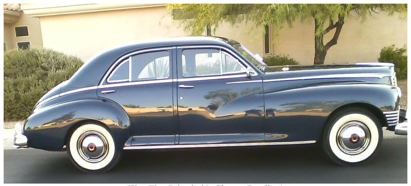
Won First Prize in it's Class at Reading!

I spied a 1947 Packard Custom Super Clipper in Atlantic Blue with its' hood up. I walked over and asked the owner if he was having trouble. He said "No, I was just showing the person here who sold the car to me that I had fully restored it and wanted him to look at it." We began talking about the car and he suggested we take it to dinner...and I could drive it. What luck!! I had always liked the 41 to 47 Clippers and here was a man who had restored one.