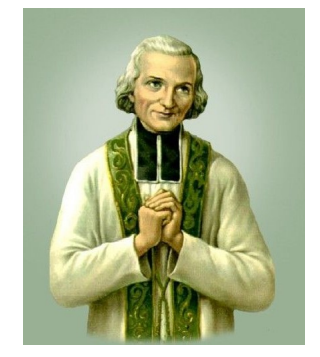
Feast Day: August 4

Because of the French Revolution, Vianney received little education. Given the anticlerical sentiment during the Reign of Terror, he was forced to make his first communion and confession secretly and was impressed by the heroism of the nuns and priests who risked their lives for their faith.