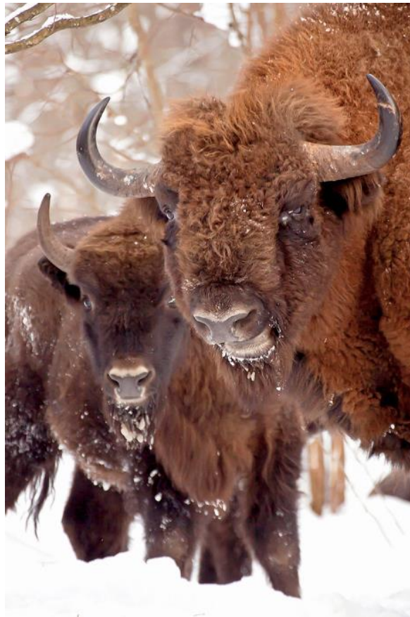
European bison, Poland. Rafal Kowalczyk.