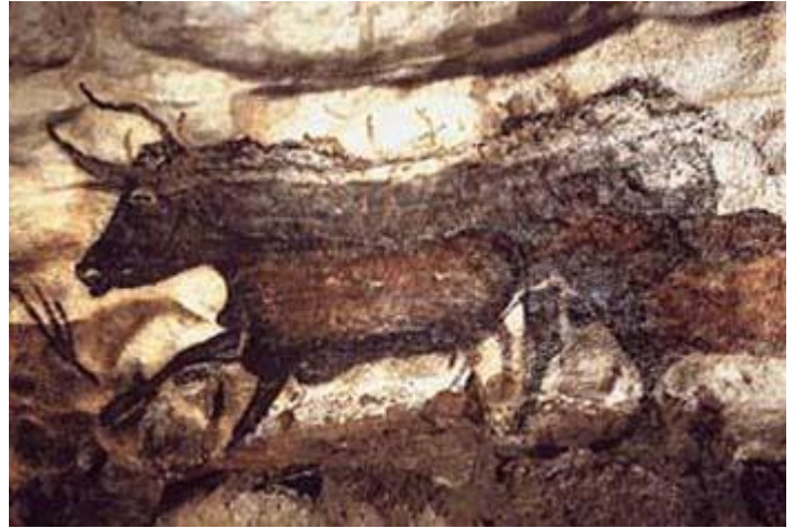
Aurochs, Lascaux Cave, France.