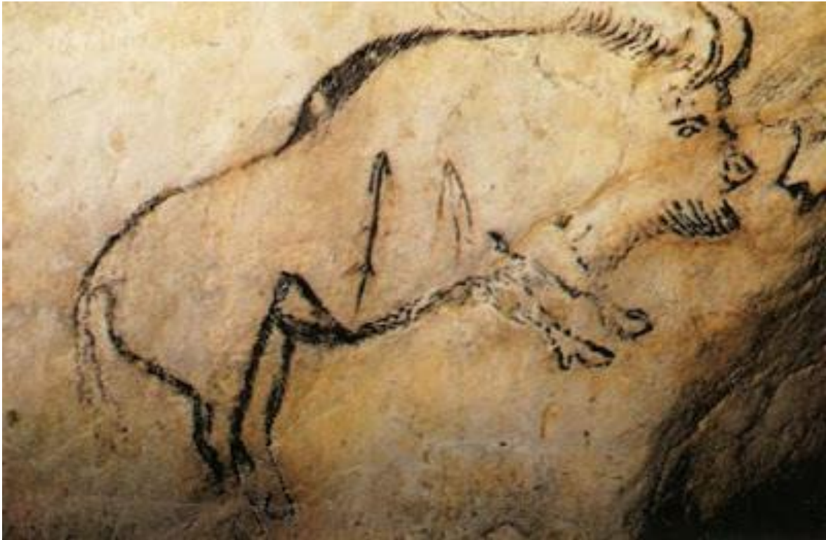
Wisent, Higgs bison. Public Domain

(Read the whole story at: http://www.smithsonianmag./smart-news/how-cave-art-helped-dig-new-animal-species-180960833/#lclx3TozUKrd8Hah.99 )