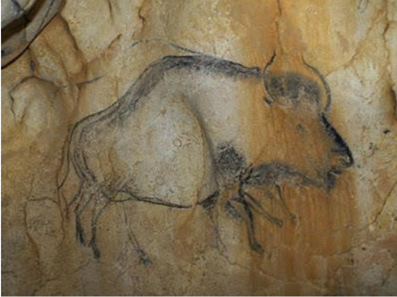
Steppe bison, Chauvet cave, France.

"Once formed, the new hybrid species seems to have successfully carved out a niche on the landscape, and kept to itself genetically,' Cooper says in the press release. 'It dominated during colder tundra-like periods, without the warm summers, and was the largest European species to survive the megafaunal extinctions.'" (Daley 2016)