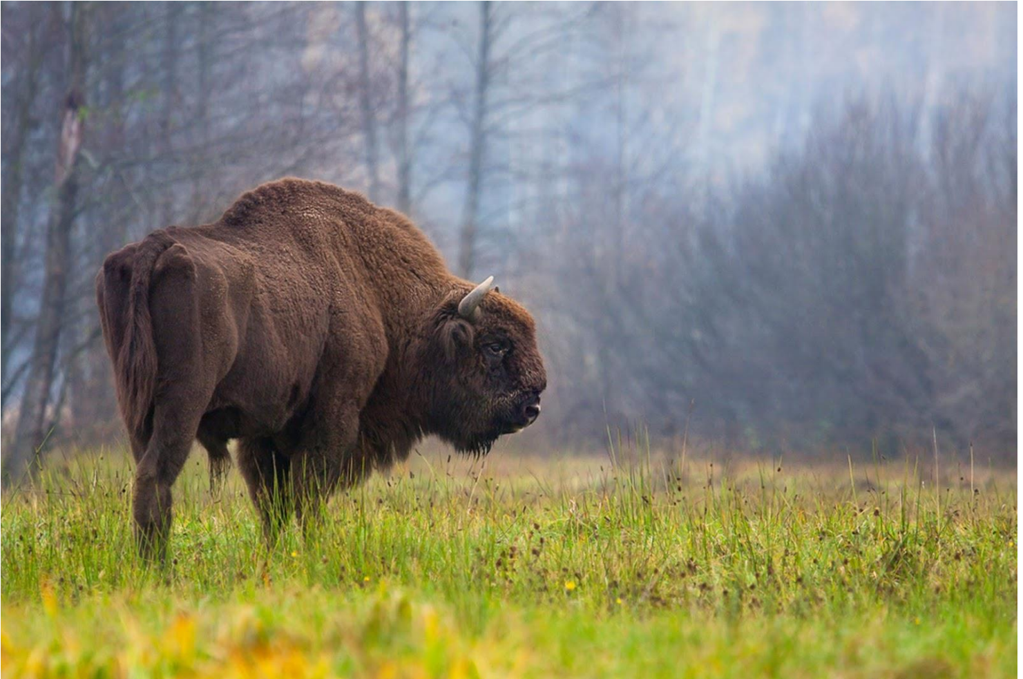
Male European bison, Poland.