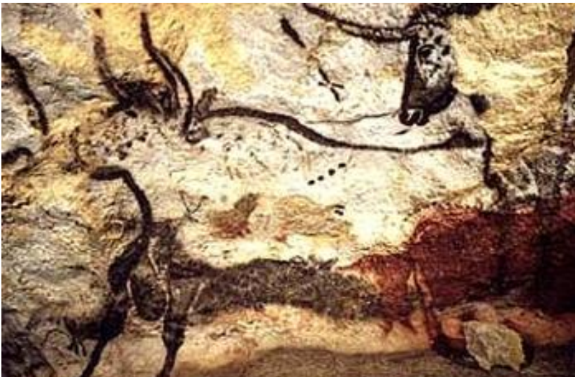
Aurochs, Lascaux Cave, France. Public Domain France.