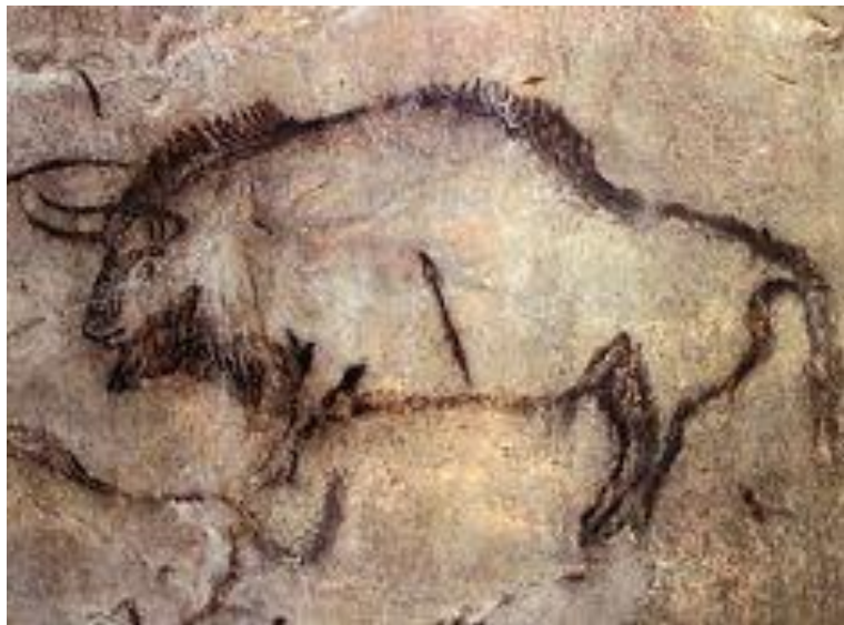
Steppe bison, Chauvet cave, France.