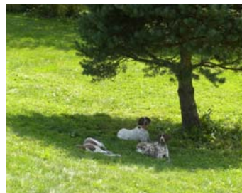
We see its a rough life living at Lou and Peg's! "The shade tree group"

HERE'S ONE OF OUR RECENT LITTER OF CHAMPION QUAIL - THAT'S "BUFFY" AND "WANDA" IN THE PICTURE STROLLING THROUGH THE NEIGHBORHOOD WITH THE PROUD DAM (CH BUFFERDINGLE'S LOW HANGING DRIPPYTUSHY) AND SIRE (VC VON SPIKEM'S RIGID RODDENDANGLE). FLIGHT-READY CHAMPION BLOODLINED QUAIL READY TO GO NOV 3D, CONTACT STEVE & PAULINE MARCQ.