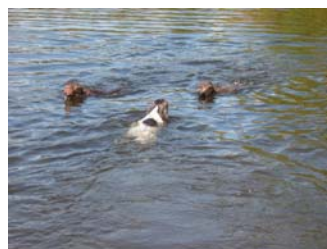
Wait.....Wait!! "I think I'm going the wrong way for that retrieve!!"