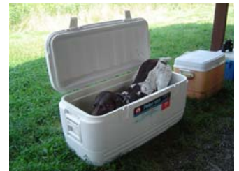
"Rudy" Russell/Newcomb the "Cool"er Dog