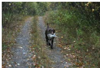
Am Can CH BIS CFC CH HHH Jam On The Brakes CHIC aka Jammer Retrieving a Ruffed Grouse in Northern Ontario October 2009