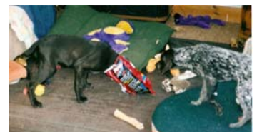
"What's in the bag?" "and where did your head go?"