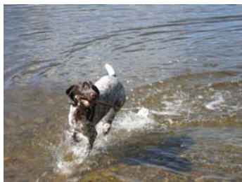
"Ava Gadava" First day of continual water retrieves at 5 months old The attention span is lengthening!