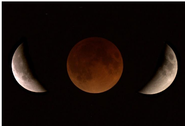
Note the round shadow

Suggest that they take a careful look at the shadow of the Earth as it moves across the bright face of the Moon. What shape is it? The round shape of the Earth's shadow suggested to the ancient Greeks, more than 2000 years ago, that the Earth's shape must be round like a ball. Eclipse after eclipse, they saw that the Earth cast a round shadow, and deduced that we lived on a ball-shaped planet (long before we had pictures of it from space).