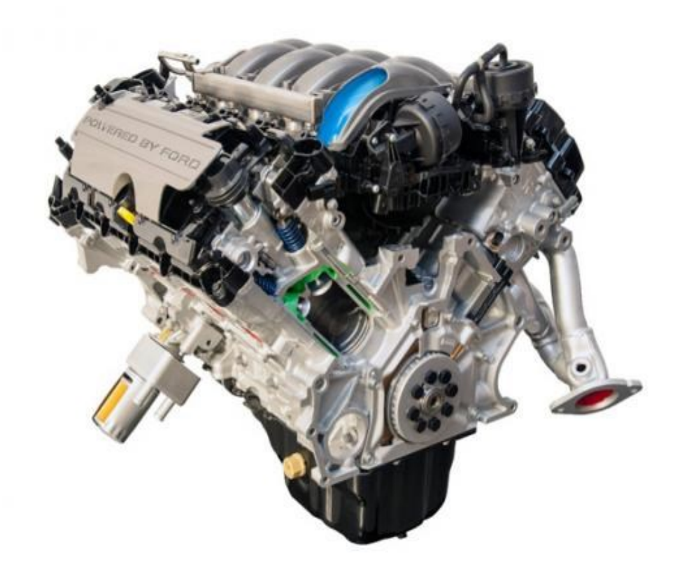
2015 Mustang 5.0 V-8 engine