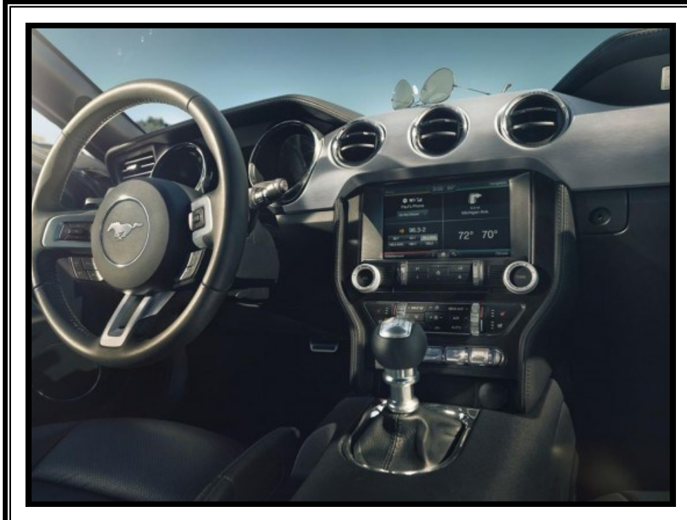
2015 Mustang dash