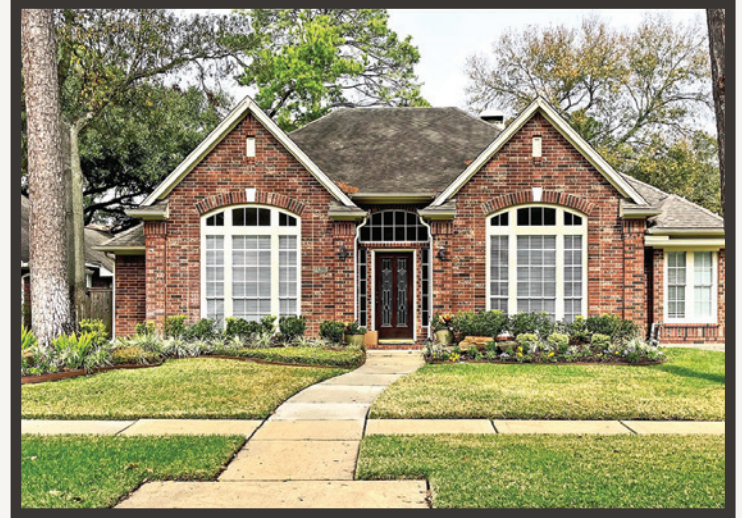
SECTION 2 8910 Andante Drive