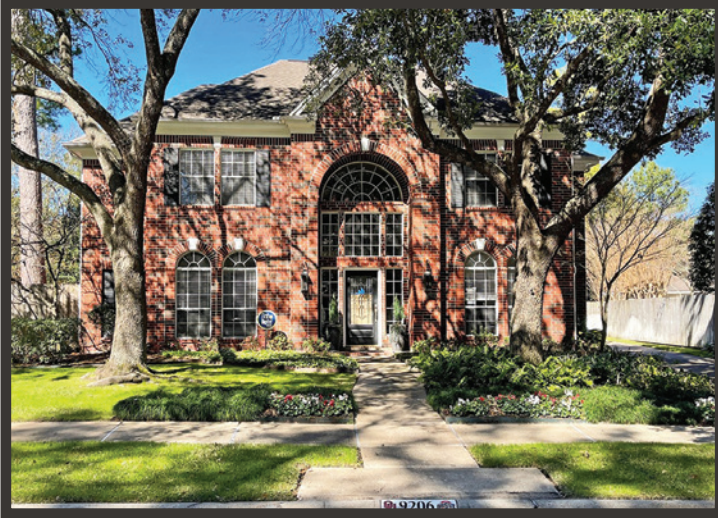
SECTION 1 9206 Brahms Lane