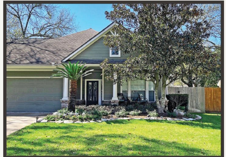
SECTION 4 8111 Clarion Way