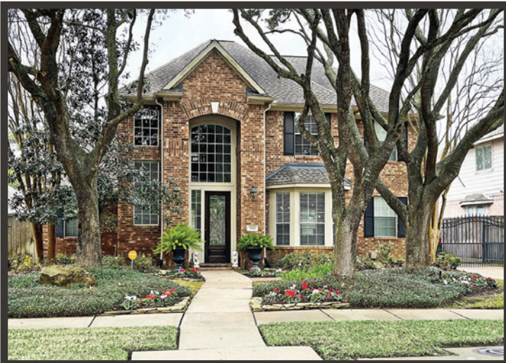
SECTION 3 7811 Adagio Avenue