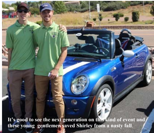
It's good to see the next generation on this kind of event and these young gentlemen saved Shirley from a nasty fall.