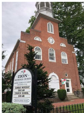
This is a picture of Zion Church past and the sign will be updated with Pastor Tom's name and more pictures next issue.