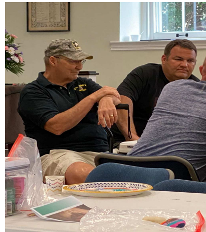
Ice Cream Social top 4 pictures and youth Sunday, August 29 the Bottom 2 pictures.