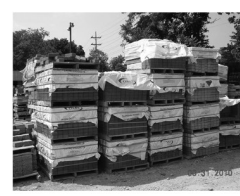
Brick & Retaining Wall Yard