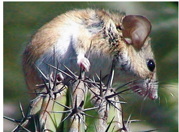
FIG. 1. Subadult male Peromyscus eva eva from north of La Paz, Baja California Sur, Mexico.