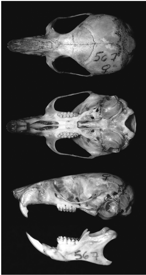
FIG. 2. Dorsal, ventral, and lateral views of cranium and lateral view of mandible of Peromyscus eva carmeni (subadult, female, Isla del Carmen, Baja California Sur, Mexico, in the collection of the Centro de Investigaciones Biológicas del Noroeste, number 567). Greatest length of cranium is 24.8 mm.

and P. fraterculus are sympatric in central Baja California Peninsula (Lawlor 1971).