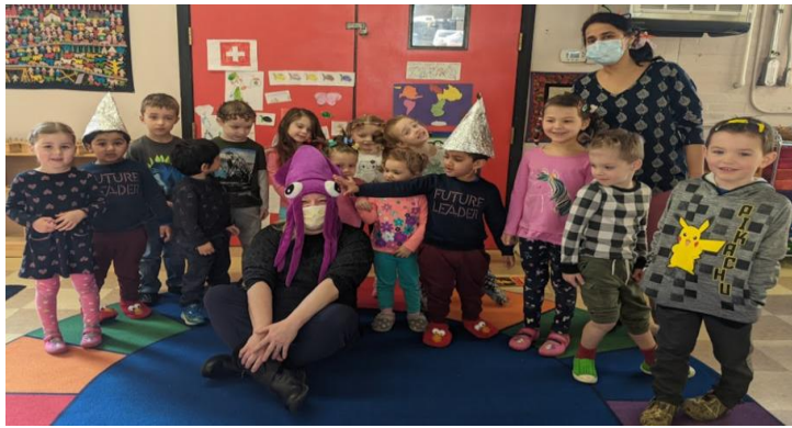
Fun with Crazy Hair Day!

For your convenience, a google sign-up link will be provided in a separate email by the end of the day on Friday, April 2nd. Each classroom will have their own link to choose a preferred time block. For the families with 2 children in attendance, you may choose two consecutive time blocks. If you have any questions, please do not hesitate to contact me!