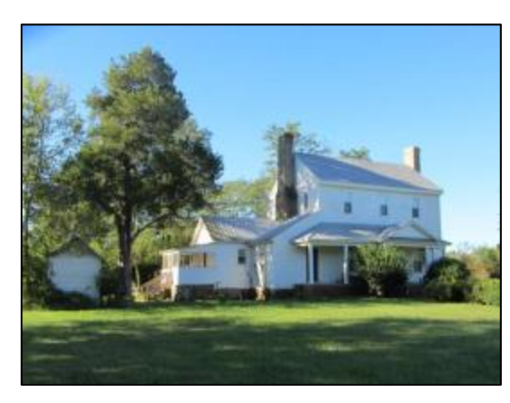
NCDOT Survey #9, Andrew Gibson Farm (GF-0585), looking southwest.

Location and Setting: The Andrew Gibson Farm is located on the south side of two-lane US 70 (Burlington Road), east of the small Whitsett settlement in a rural section of eastern Guilford County (Figures 22–29). The property is bounded by open fields and wooded tracts. The immediate setting of the property consists of a grass lawn with scattered fruit and ornamental trees and a single row of