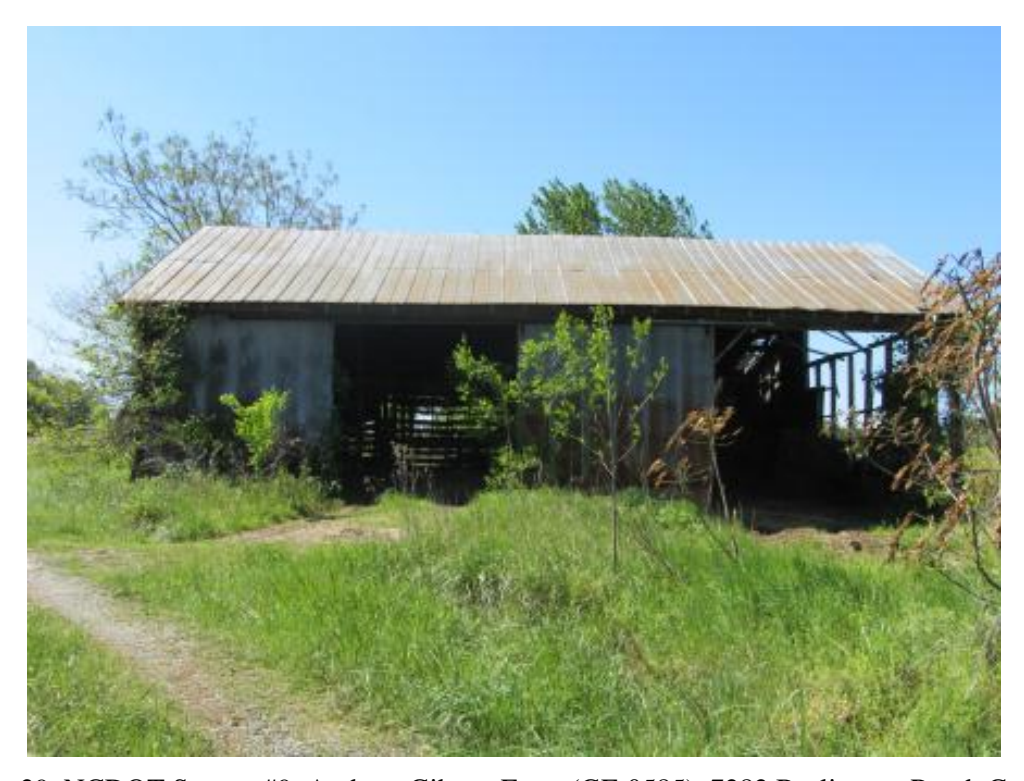
Figure 29. NCDOT Survey #9, Andrew Gibson Farm (GF-0585), 7282 Burlington Road, Guilford County, view of ca. 1930 vehicle shed, looking south.