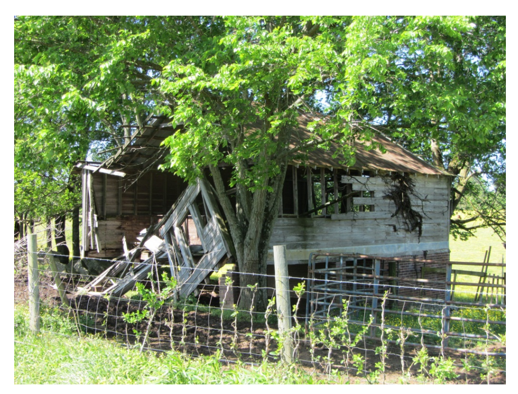
Figure 28. NCDOT Survey #9, Andrew Gibson Farm (GF-0585), 7282 Burlington Road, Guilford County, view of deteriorated secondary residence, looking southwest.