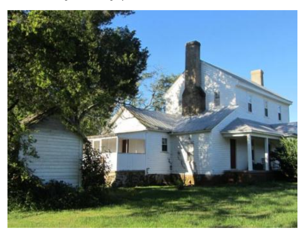
Figure 23. NCDOT Survey #9, Andrew Gibson Farm (GF-0585, 7282 Burlington Road, Guilford County), northeast elevation, looking south-southwest; wellhouse is on the left.

Vehicle/equipment shed: To the south of the barn is a one-story ca. 1930 frame vehicle/equipment shed oriented toward US 70 to the north. The shed is clad in corrugated metal panels and has a metal-clad side-gable roof with exposed rafter tails. Several sections of metal wall-cladding are missing on the façade and west elevations. The building retains integrity.