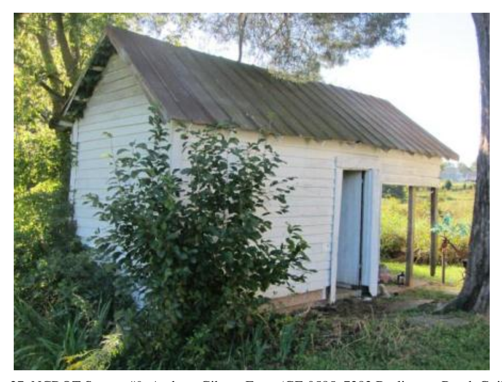
Figure 27. NCDOT Survey #9, Andrew Gibson Farm (GF-0585, 7282 Burlington Road, Guilford County), wellhouse, west elevation, looking southeast.