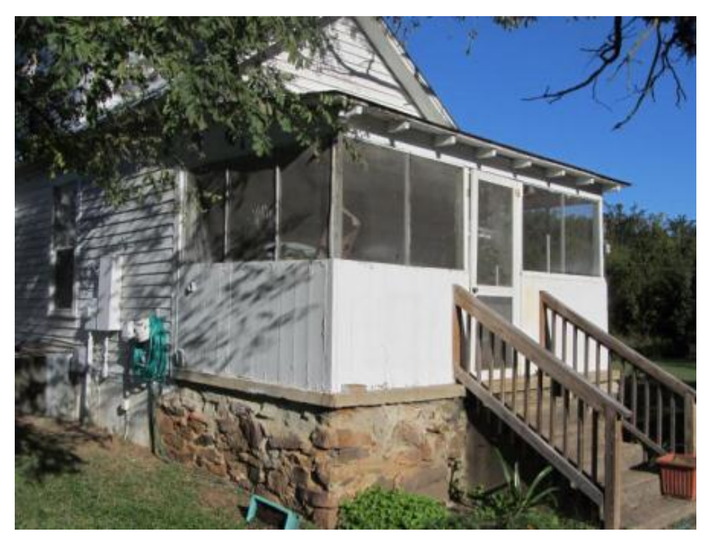
Figure 24. NCDOT Survey #9, Andrew Gibson Farm (GF-0585, 7282 Burlington Road, Guilford County), detail of twentieth-century porch on the east gable end, looking northwest.