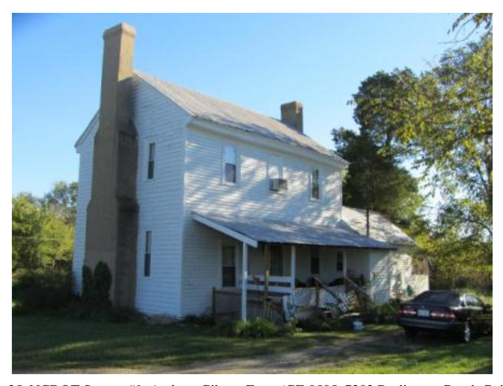
Figure 25. NCDOT Survey #9, Andrew Gibson Farm (GF-0585, 7282 Burlington Road, Guilford County), south (rear) elevation and west gable end, looking northeast.