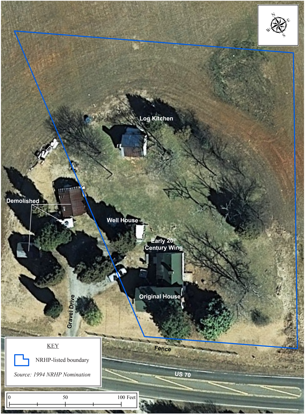
Figure 21. NCDOT Survey #45, Dr. Joseph A. McLean House (GF-1535), 6069 Burlington Road, Guilford County, aerial photograph (2010) showing NRHP boundary.