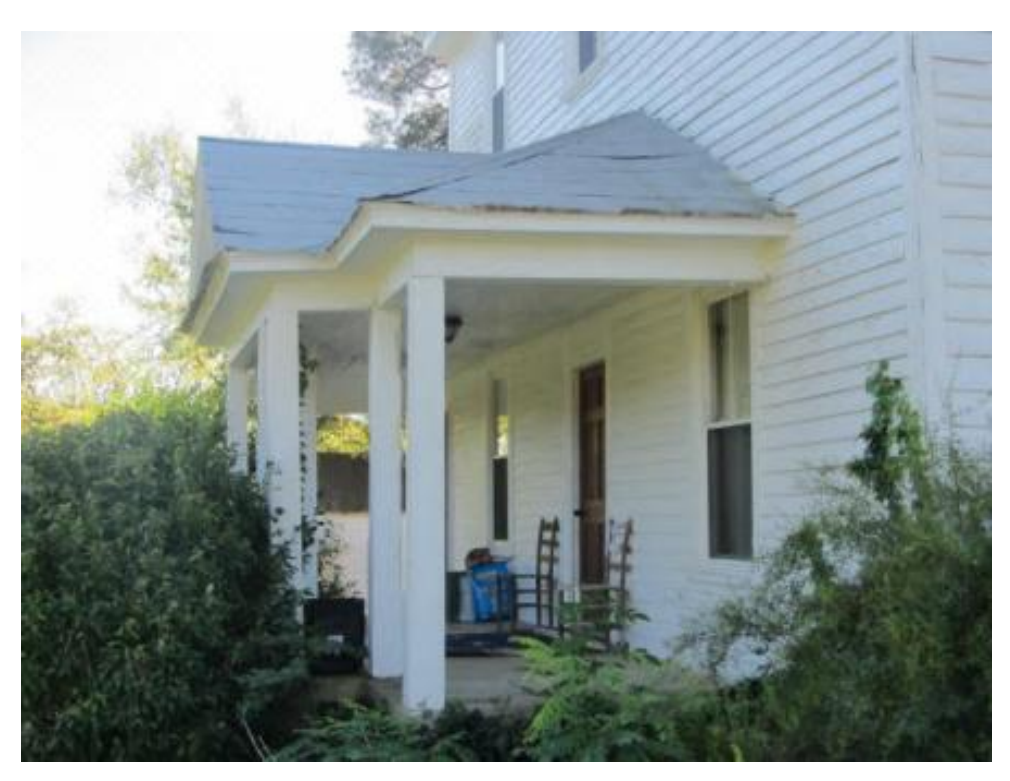
Figure 26. NCDOT Survey #9, Andrew Gibson Farm (GF-0585, 7282 Burlington Road, Guilford County), detail of ca. 1895 porch across the north façade, looking southeast.