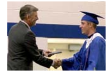
File Graduation Photo cropped >

Kansas & Reno Co Schools feel the crunch... Making do: (All Reno Co Schools Address Problem) Schools' approaches to meeting budget challenges vary – article: www.hutchnews.com/Todaystop/schools2010-01-08T20-59-19 (Solutions, layoffs & cuts vary from district to district but all agree there are no easy fixes)