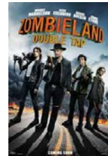
ZOMBIELAND 2: DOUBLE TAP 10/22/19