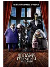
THE ADDAMS FAMILY (2019) 10/26/19