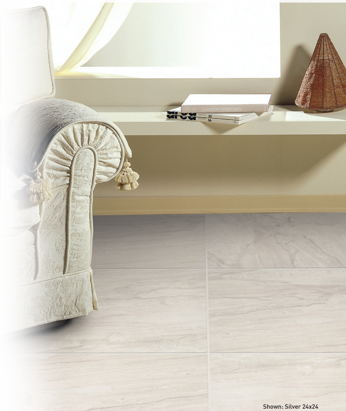
Shown: Silver 24x24