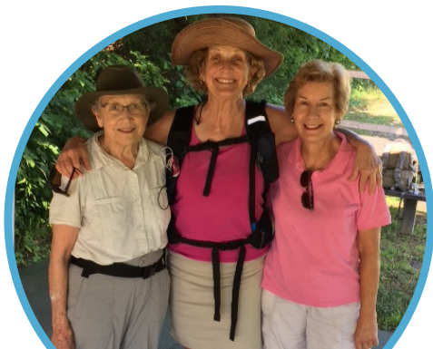
TAKE A HIKE!

Since its inception, The FriendShip has had varied programs to foster social engagement and strengthen connections across the network. This year, unlike previous years, the Program Committee has provided three regularly scheduled programs per month: a Dutch treat lunch during the first week of the month, a mid-month special program or outing, and a social hour during the fourth week of the month.