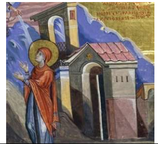
"Hannah, Prophetess and Mother of Samuel, Thanking God" from Art in the Christian Tradition, a project of the Vanderbilt Divinity Library, Nashville

Come, let us present ourselves before our God. Bring all your troubles and anxiety to God in prayer.