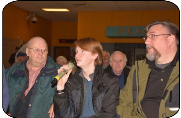
Grandfather, grandson and father attending the clinic to learn more about their project