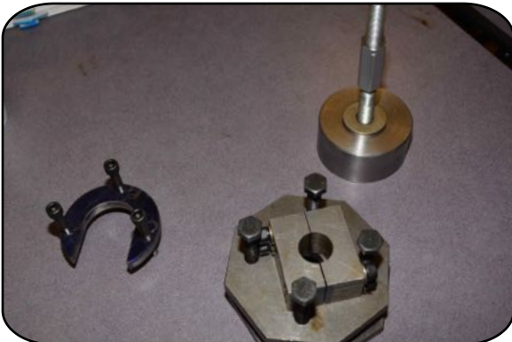
Phil Zins brought some rear end service tools he built in his shop