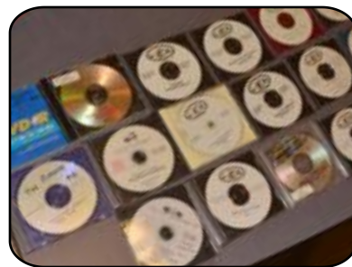
Books, entertaining Dvds and technical Cds available for check out