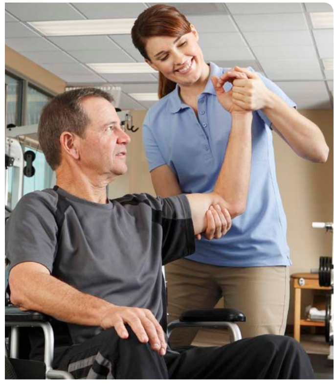
Physical therapy and range-of-motion exercises are effective ways to strengthen limbs and prevent muscular contracture.