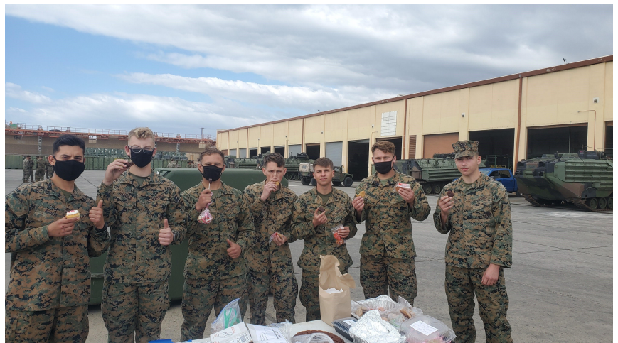
Our troops sure do love their cookies...Yum!