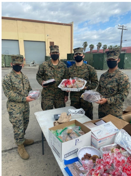
(Above and below) Showing off their Valentine's Day haul of treats!