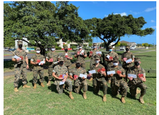
Soldiers feeling the love from CVRWF on Valentine's Day