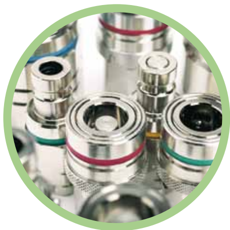
With or without valve

CEJN modular couplings are available in nickel-plated brass with nitrile seals and AISI 316 stainless steel with Viton® seals. EPDM and Kalrez® seals are available upon request to comply with specific performance objectives.