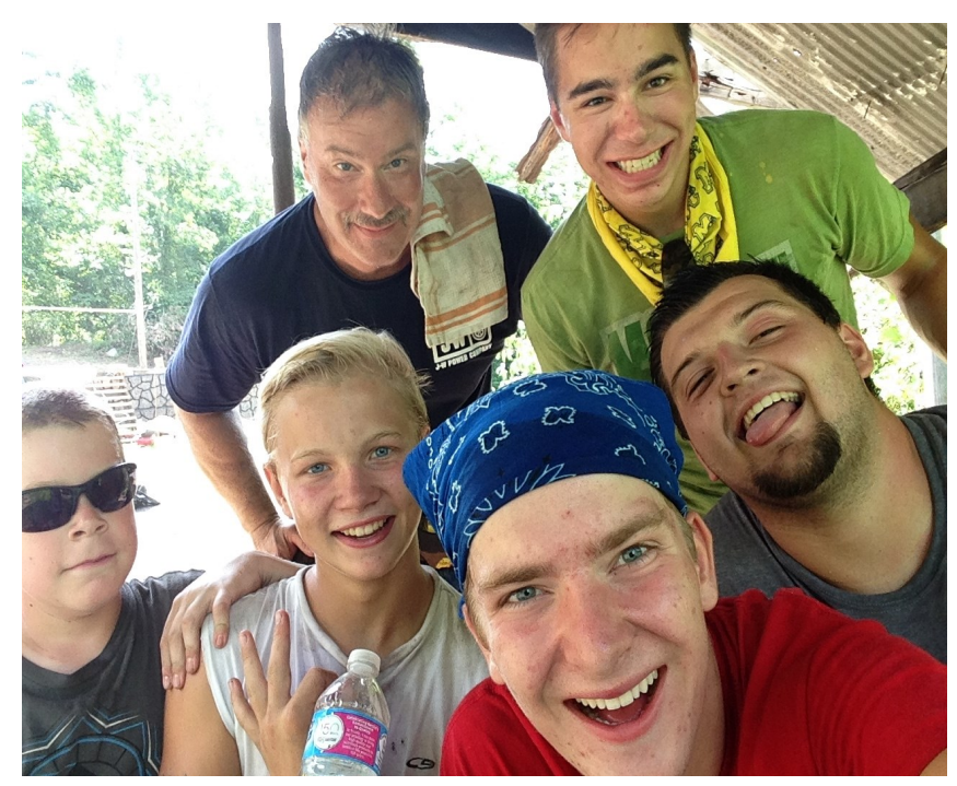
MCDOWELL COUNTY, WEST VIRGINIA MISSION TRIP