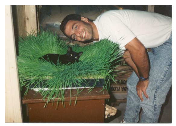
Rockette and me at Optimum Health 1995.

Wheatgrass soaked bandage for sores, can be applied right to their wounds. Grow small amount in the house for cats to play with (this will take their attention away from your plants). Good luck!