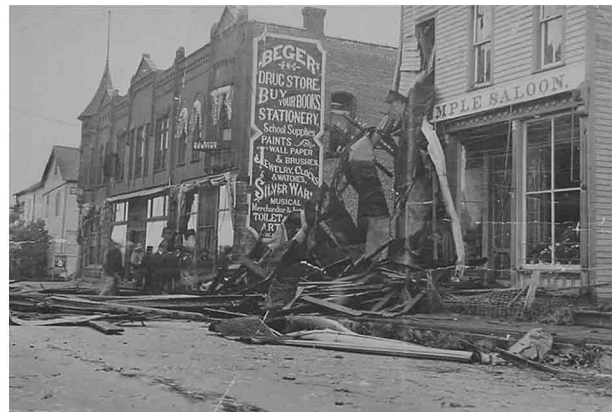
Above: The results of a 1903 tornado