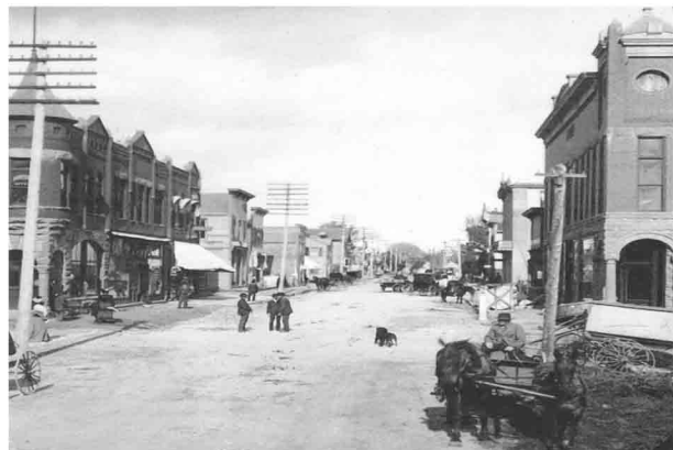
Early 1900 street scene, looking east on Mulholland