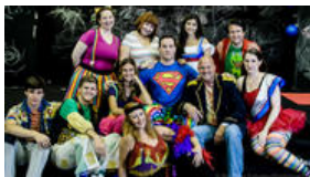
Pasadena goes back to the good book for latest 'Godspell' production