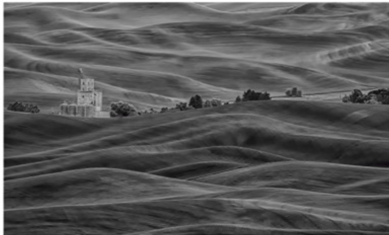
The Grainery, Washington State