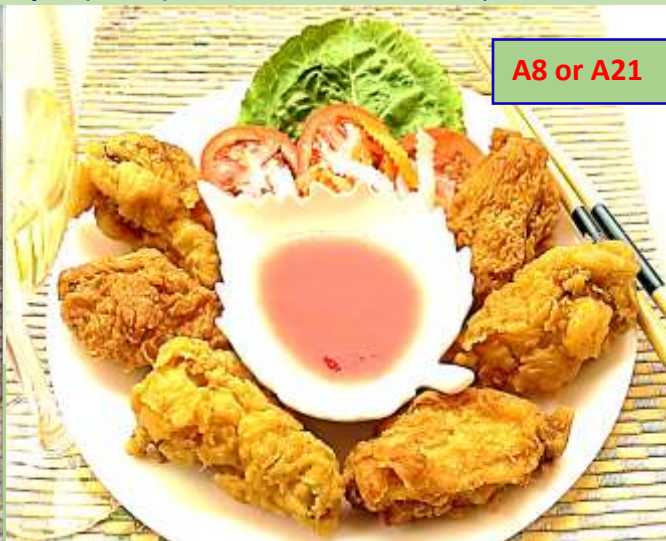
A8 or A21