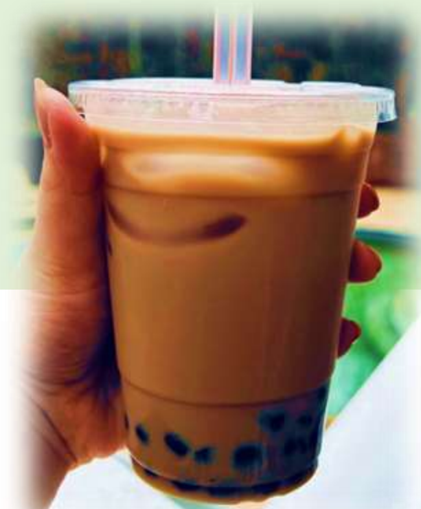
Milk Tea or Bubble Tea (non dairy)

Add: Tapioca Pearls (Boba) or Grass Jelly or Mango Popping Pearl or BlueBerry Popping Pearl + $0.75 All Smoothies, 12oz Glass = $6.75 16oz Togo Cup = $7.59