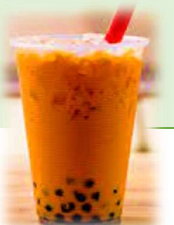
Thai Tea (contains dairy)