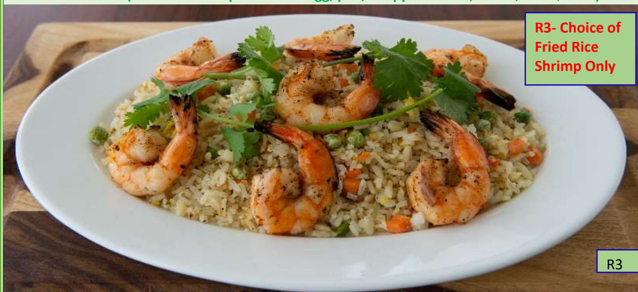
R3- Choice of Fried Rice Shrimp Only