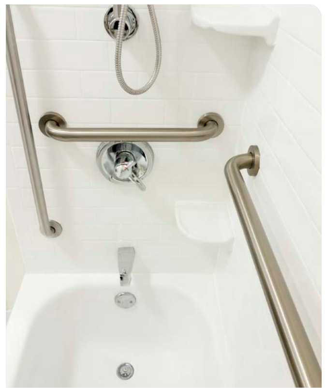
For your safety, you may need to have handrails installed in your bathroom.

Most stroke survivors are able to return home and resume many of the activities they did before the stroke. Leaving the hospital may seem scary at first because so many things may have changed. The hospital staff can help prepare you to go home or to another setting that can better meet your needs.