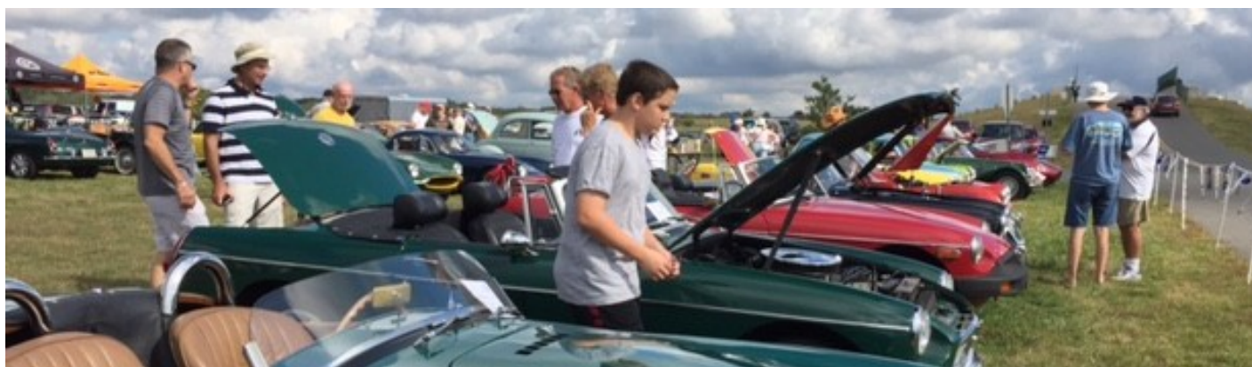
BMC's Annual Show at NJMSP in Millville