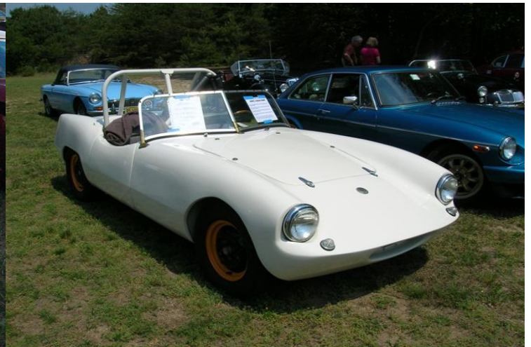
Gary Cossaboon's '59 ELVA Courier 1500 Mk I

The weather on Sept. 19 was clear and sunny, an ideal day for a car show and for racing. The motorcycle racing teams surrounding our show ground were very active throughout the day. Large displacement vintage motorcycles burning high octane racing fuel do not have on board electric starters and due to high compression (up to 13 to 1) cannot be started using their kick levers. A battery powered roller "treadmill" is used to turn the rear wheel and start these bikes.