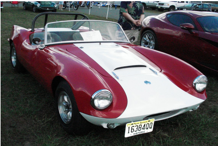
Carl Schwab's '59 ELVA Courier Mk I