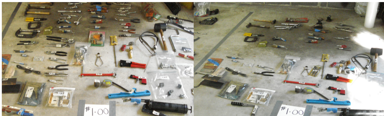
Before (left) and after (right) of tool sale