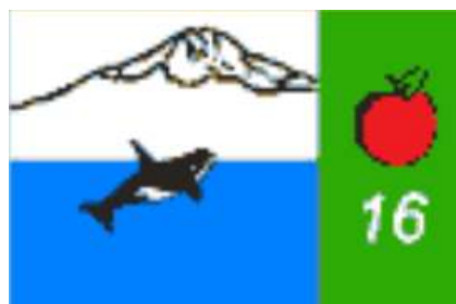
Winter 2016 Newsletter

Click on the icons to open latest editions of the magazines and information.