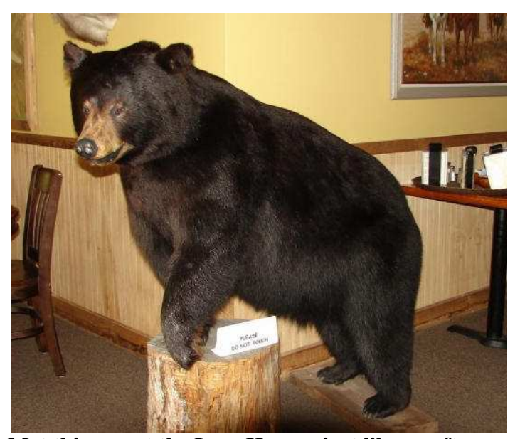
Met this guy at the Inn. He was just like us after we finished eating -stuffed (Groan!!)