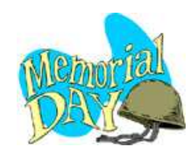
Remembering our Armed Forces Victory in Europe May 8th Armed Forces Day May 18th