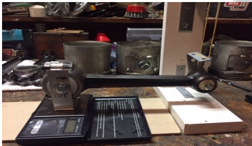
Connecting Rod weighing fixture

Connecting Rods – The Red Model A repair bible written by Les Andrews calls for both the crank end and pin ends to be equal weight within +/- 1 gram. A homemade fixture was fabricated with the help of Ken Kovach and his lathe. The fixture weighs one end with the other suspended so friction is eliminated. I was able to get all the rods to within +/- 2 tenths of a gram for the crank end, pin end and overall weight.